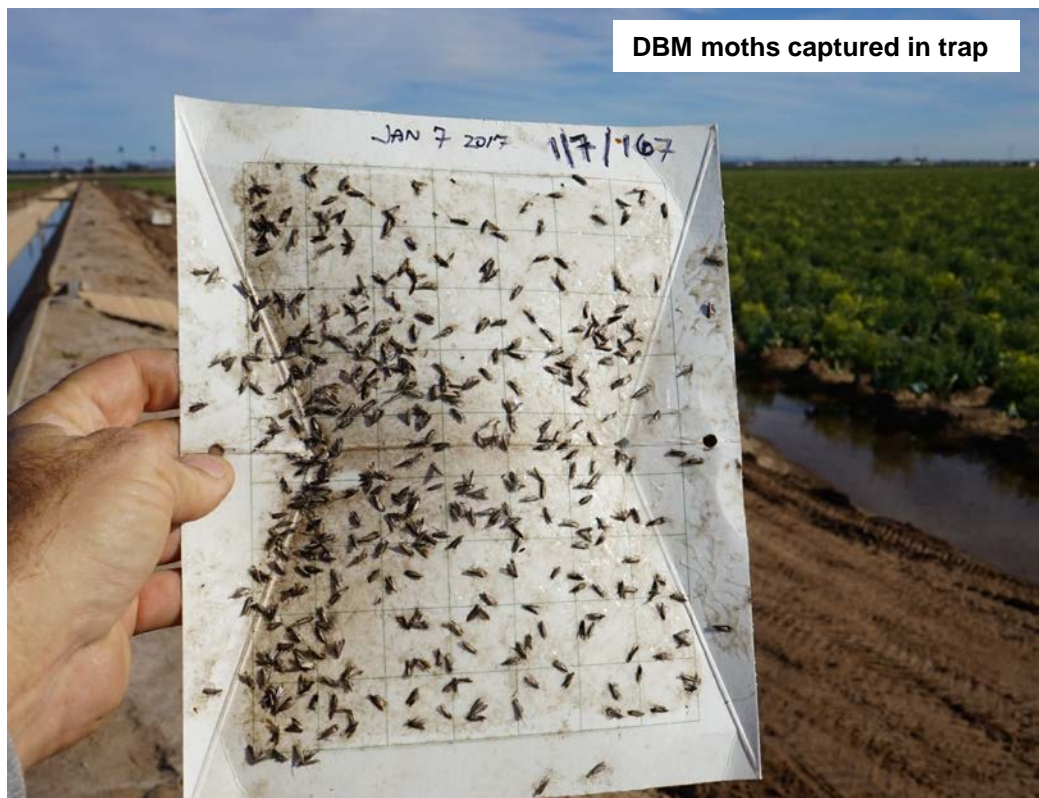
DBM moths captured in trap